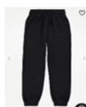
From £6 Black Joggers ★★★★★ (111)