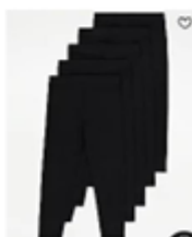
From £12 Black Leggings 5 Pack ★★★★★ (1438)