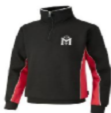
Black/red fleece with white trim