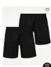
From £4 Black School Football Shorts 2 Pack ★★★★★ (148)