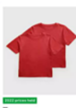
To Red Plain School Sports T-Shirts 2 Pack ★★★★★ (1) From £3.00