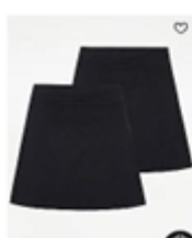
From £5 Girls Black School Skirts 2 Pack ★★★★★ (349)

Examples of items that are available from supermarkets: