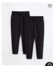
From £8 Black School Slim Leg Joggers 2 Pack ★★★★★ (281)