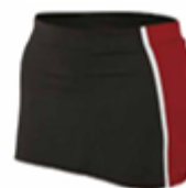
Black/red panelled skirt

Only the black/red 1/4 zip top can be worn (as seen above) - no plain zip tops or hoodies