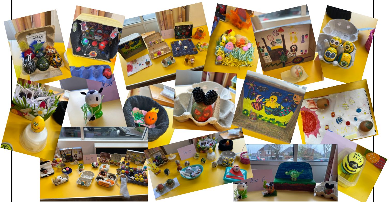
Year 6 - Xanthe W in Attenborough