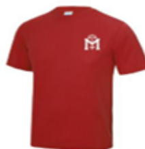
Red cotton PE top