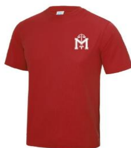
Red cotton PE top