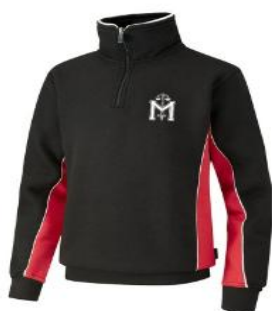
Black/red fleece with white trim

Second hand uniform can sometimes be purchased through the school office, but due to the uniform being relatively new, we do not have a large amount of this.