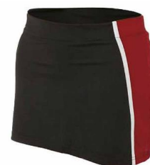
Black/red panelled skirt